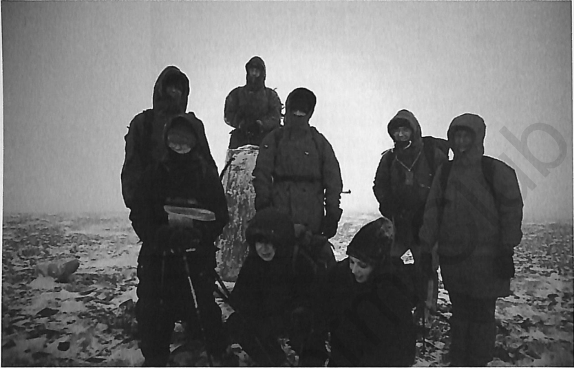
A Happy Group on the Summit of Culardoch!

and very few managed to get there, in fact those that did were all late for their tea at the Inver Hotel. There followed a short but much-enjoyed ceilidh dance.