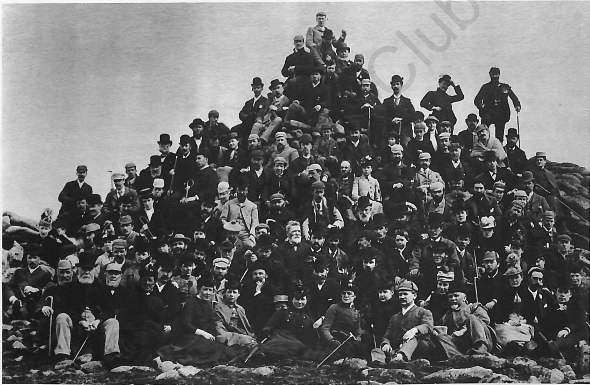
The Cairngorm Club at the Summit of Mount Keen 1890