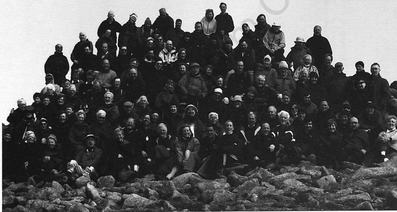
The Cairngorm Club at the Summit of Mount Keen, May 6 th 2000