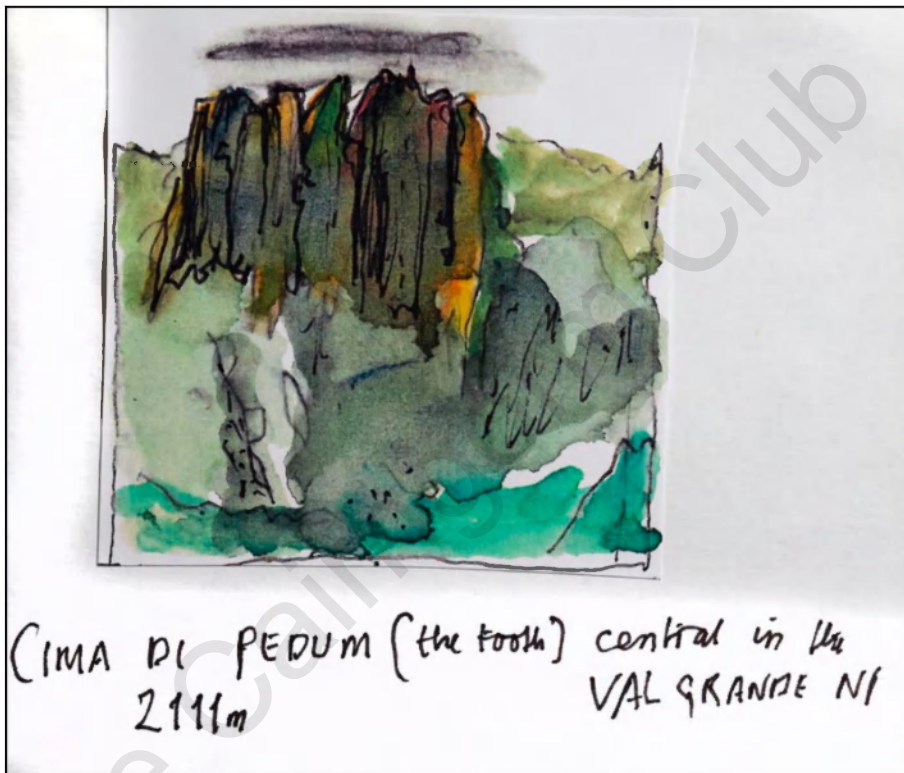
Val Grande The Tooth

Cima di Pedum, 2111m., (the tooth) arises in the central area of the National Parc and is found by many to be more beautiful than the Matterhorn.”